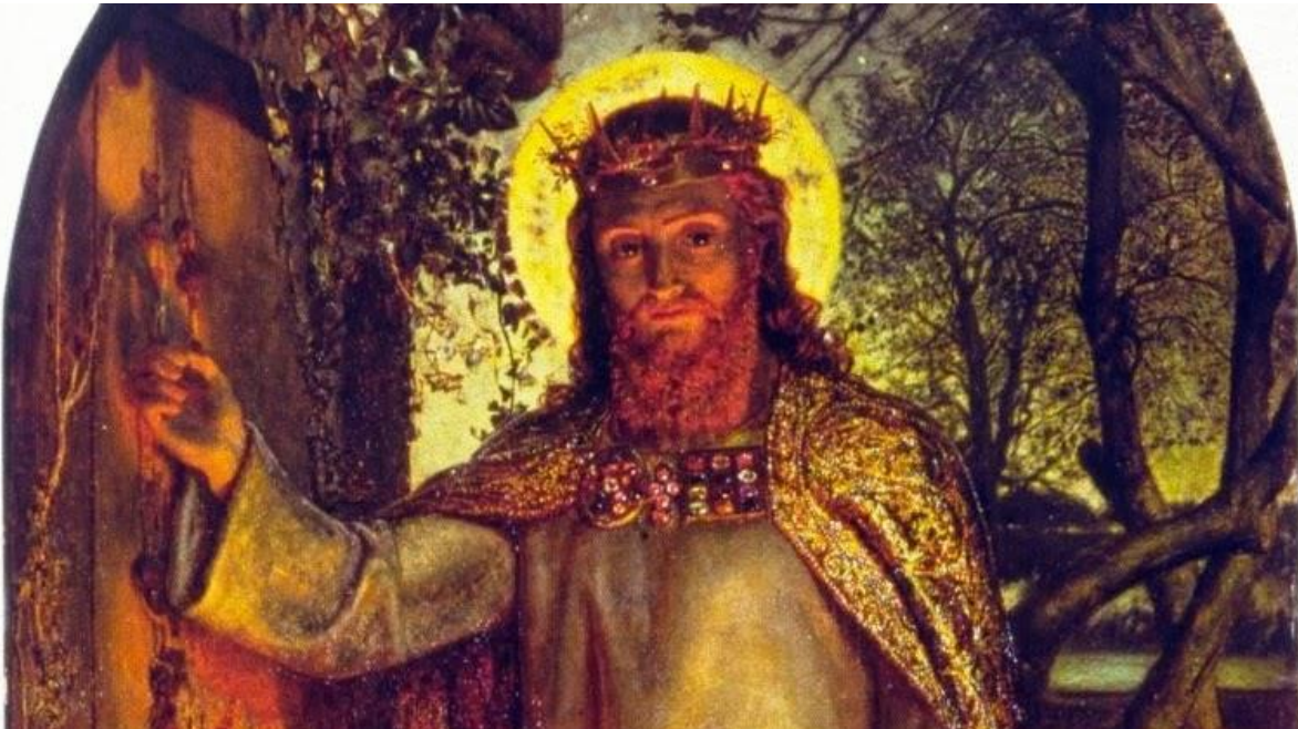
Holman Hunt’s “Light of the World”

The highlight of my first visit to St. Paul’s Cathedral in London was Holman Hunt’s magnificent painting entitled, “The Light of the World.” It caught me by surprise the first time because it didn’t seem to be located in a prominent place in the church. I turned a corner, and there it was! The painting is entitled “The Light of the World,” but it is rather dark. Jesus is in the shadows, carrying a lamp. His face is lit and He is knocking on a door overgrown with vines. The door has no handle. It must be opened from the inside. The only light comes from the lantern that Jesus carries. The painting is very compelling. Holman Hunt painted this in 1853 and many came to faith in Christ as a result of viewing this painting.